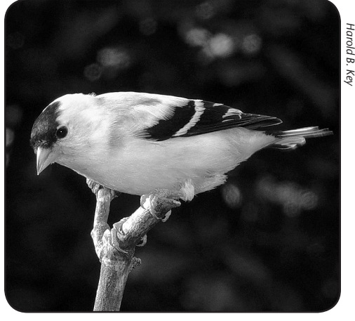
We can tell that this American Goldfinch is an adult male in the breeding season.