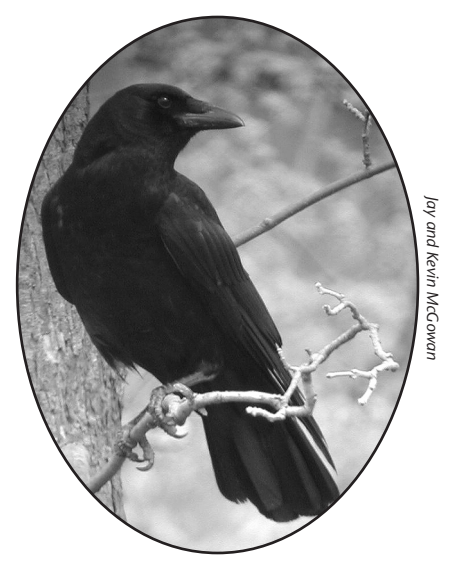
We can't tell if this American Crow is a male or female, young or old, or if it is in the breeding season, since crows always look so similar to each other.

Now that you know what's in a field guide, try looking up some birds that interest you to learn more about them!